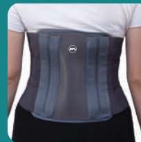
Contoured Lumbar Support