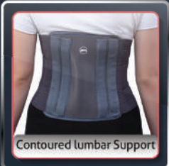
Contoured lumbar Support