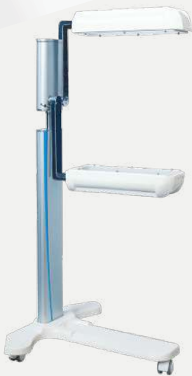
Double Surface Phototherapy