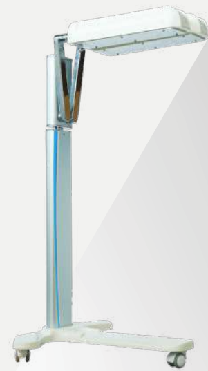
Single surface Phototherapy

Blossom-Duo's unique design ability to cover the maximum body surface area makes it the equivalent of 2 phototherapy units in one single body. Plus, the irradiance of the 24 LED lamps can be modulated to provide uniform coverage based on patient needs. And finally, you can measure the actual irradiance using the optional irradiance meter. All in all you have a complete phototherapy package in a single elegant unit.