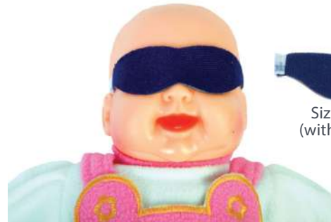
Size : Pre-Term (without adjuster)